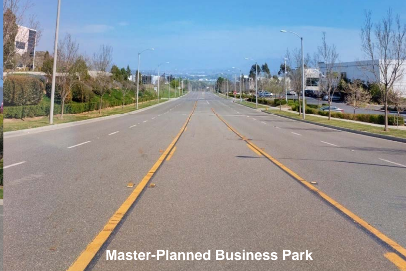
Master-Planned Business Park